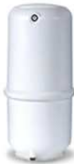
RO PRO® (Only 9" wide)