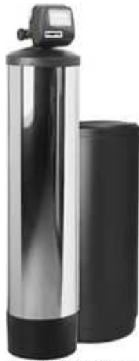
Shown with Stainless Steel Jacket

Designed with conservation in mind, Watts Dual Chamber & Tri-Plex™ Tanks contain high performance media, state of the art control valve technology and the new Vortech™ distribution system for greater efficiency.